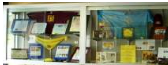
Our club's traveling display by Roji Rao