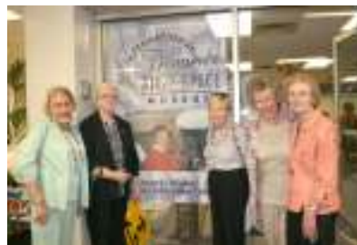
The Joan Hrubec Center

The new room houses a permanent exhibit about Joan and is full of interactive aviation exhibits for children, including information on careers as well as costumes and props to allow children to imagine themselves in the worlds of flight and space. The Hrubec Center will be open regularly on Saturdays and other days for prearranged tour groups. Joan was indeed a very special Zontian.