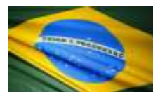
The flag of Brazil

*UNIRCOM NOTES is a new feature for our newsletter with international news from the United Nations/International Relations Committee .